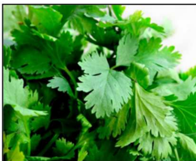
CORIANDER KOLENDRA COENTROS CORIANDRU