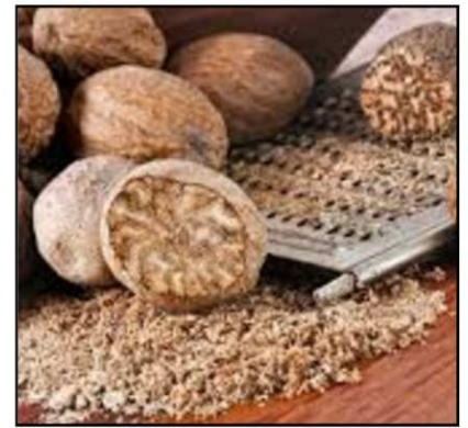
NUTMEG GAŁKA MUSZKATOŁOWA NOZ MOSCADA NUCȘOARĂ