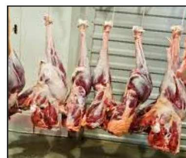
OSTRICH STRUŚ AVESTRUZ STRUȚ