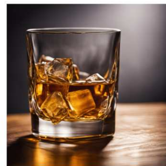
WHISKY GLASS SZKŁANKA DO WHISKY VIDRO DE WHISKY PAHAR DE WHISKY