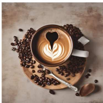
COFFEE KAWA CAFÉ CAFEA