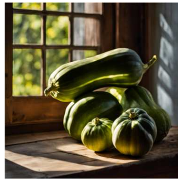
MARROW KABACZEK CHAYOTE ZUCHINNI