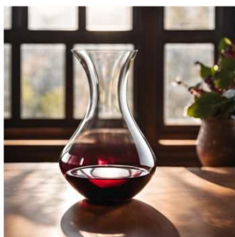
DECANTER KARAFKA DECANTADOR DECANTOR