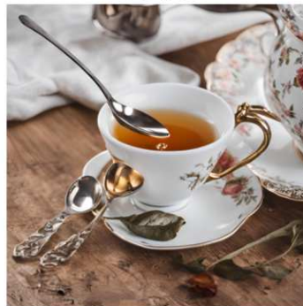
TEASPOON ŁYŻECZKA COLHER DE CHĂ LINGURIȚĂ