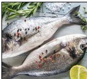
GOLDEN DOURADA ZŁOTA DORADA DOURADA DOURADA AURIE