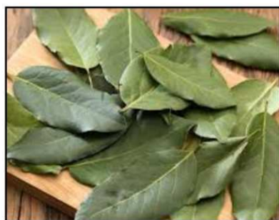
LAUREL LIŚĆ LAUROWY LOURO FRUNZE DE DAFIN