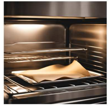
BAKING PAPER PAPIER DO PIECZENIA PAPEL VEGETAL HÂRTIE DE COPT