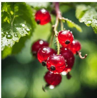
RED CURRANT CZERWONA PORZECZKA GROSELHA VERMELHA COACĂZ ROȘU