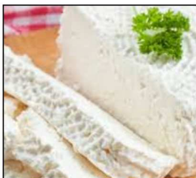
CREEM CHEESE TWARÓG QUEIJO CREME PASTA DE BRÂNĂ