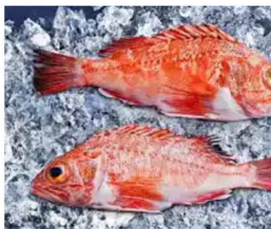
REDFISH KARMAZYN CANTARILHO PEȘTE ROȘU