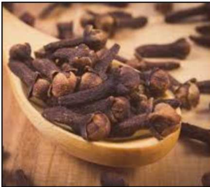
CLOVE GOŹDZIK CRAVINHO DA INDIA CUIȘOARE