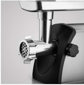
ELECTRIC MEAT MINCER MASZYŃKA DO MIELENIA PICADOR ELÉTRICO DE CARNE MAȘINĂ DE TOCAT CARNE ELECTRICĂ