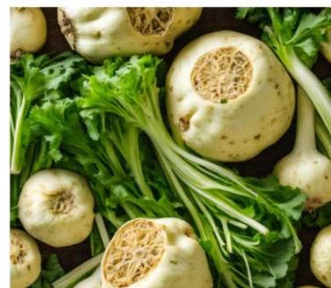
CELERY ROOT SELER KORZENIOWY RAIZ DE AIPO RĂDĂCINĂ DE ȚELINĂ