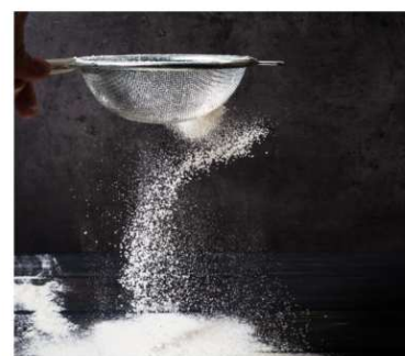
SIEVE SITKO PENEIRA SITĂ