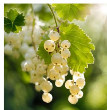
WHITE BERRY BIAŁA PORZECZKA BAGO BRANCO FRUCTE DE PĂDURE ALBE