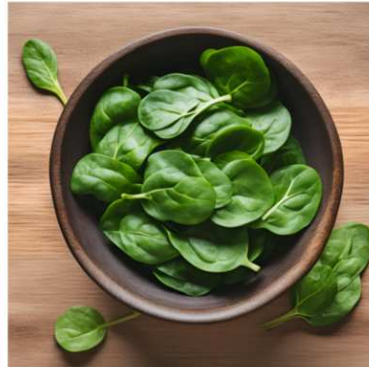
SPINACH SZPINAK ESPINAFRES SPANAC