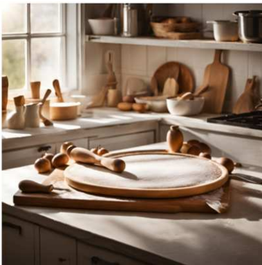
PASTRY BOARD STOLNICA TÁBUA DE PASTELARIA PLACĂ DE PATISERIE