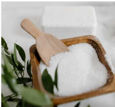
SALT SÓL SAL SARE