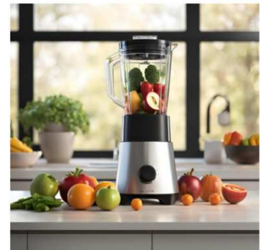
FOOD PROCESSOR ROBOT KUCHENNY PROCESSADOR DE ALIMENTOS ROBOT DE BUCĂȚĂRIE