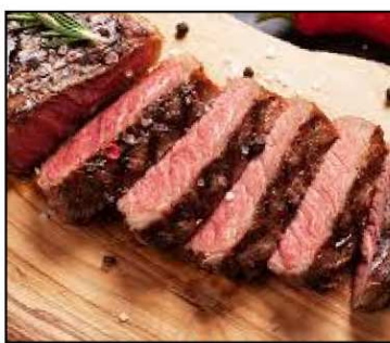
BEEF WOŁOWINA VACA VITÂ