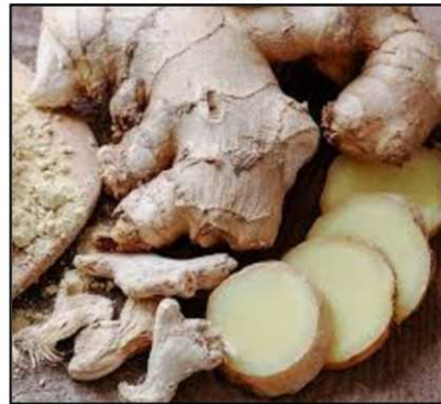
GINGER IMBIR GENGIBRE GHIMBIR