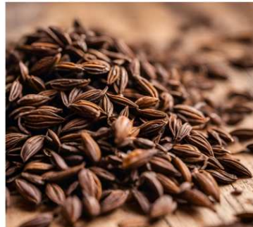
CUMIN KMINEK COMINHO CHIMION