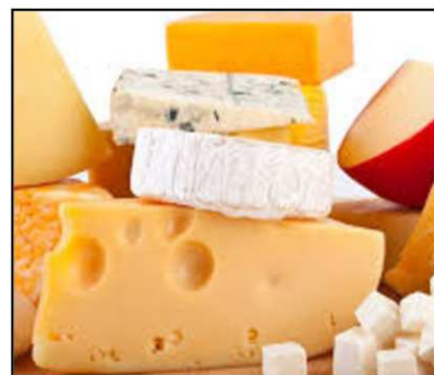
CHEESE SER QUEIJO BRÂNĂ