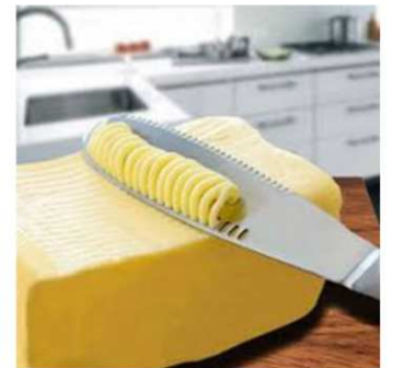
BUTTER'S KNIFE NÓŻ DO MASŁA FACA DE MANTEIGA CUȚITUL UNTULUI