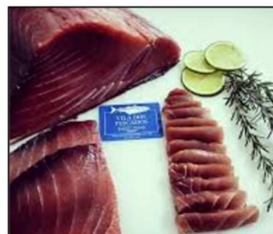
TUNA TUŃCZYK ATUM TON