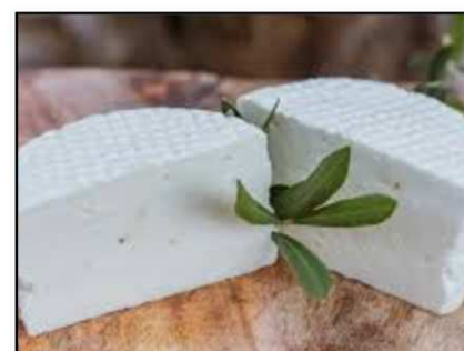
FRESH CHEESE ŚWIERZY SER QUEIJO FRESCO BRÂNĂ PROASPĂ