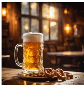
BEER MUG KUFEL DO PIWA CANECA DE CERVEJA HALBĂ DE BERE