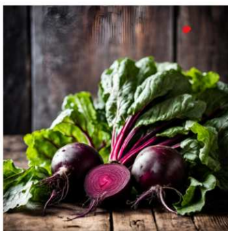
BEETROOT BURAK BETERRABA SFECLĂ