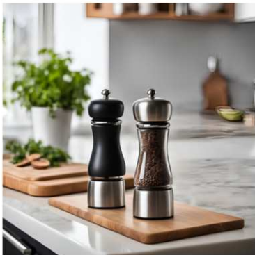
SALT AND PEPPER MILL MŁYNEK DO SOLI I PIEPRZU MOINHO DE SAL E PIMENTA RĂȘNITĂ