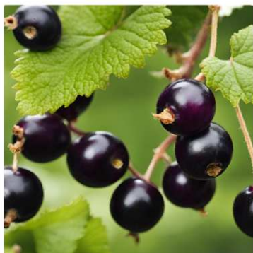
BLACKCURRANT CZARNA PORZECZKA GROSELHA PRETA COACĂZE NEGRE