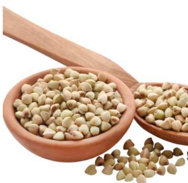
WHITE BUCKWHEAT GROATS BIAŁA KASZA GRYCZANA GRUMOS BRANCOS DE TRIGO MOURISCO CRUPE DE HRIȘCĂ ALBĂ