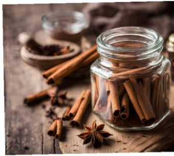
VANILLA WANILIA BAUNILHA VANILIE