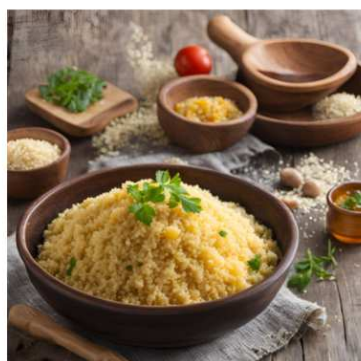
COUSCOUS KASZA KUSKUS CUSCUZ CUȘCUȘ