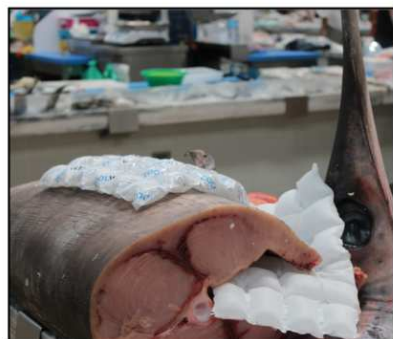
SWORDFISH WŁÓCZNIK ESPADARTE PEȘTE SPADĂ