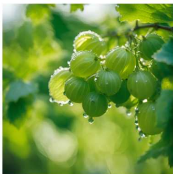
GOOSEBERRY AGREST GROSELHA AGRIȘĂ