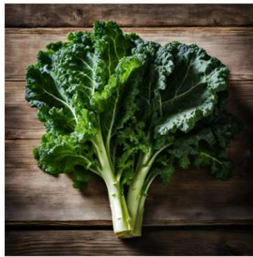
KALE JARMUŻ COUVE KALE