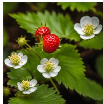
WILD STRAWBERRY POZIOMKA MORANGO SELVAGEM CĂPȘUNI SĂLBATICE