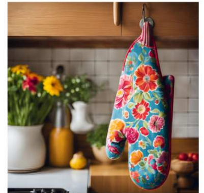
OVEN GLOVE REKAWICA LUVĂ DE FORNO MĂNUȘĂ DE CUPTOR