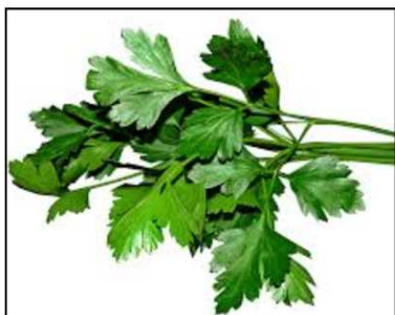
PARSLEY PIETRUSZKA SALSA PĂTRUNJEL