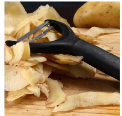
PEELER OBIERACZKA DESCASCADOR CURĂȚĂTOR