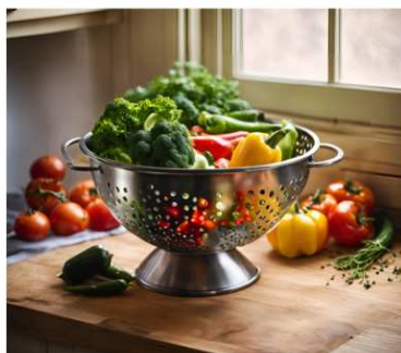
COLANDER DURSZLAK COADOR STRECURĂTOARE