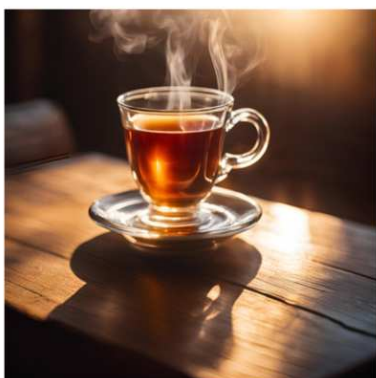
TEA HERBATA CHÁ CEAI