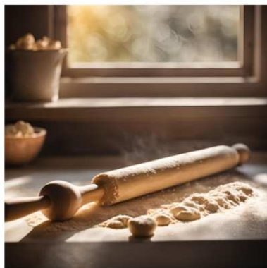
ROLLING PIN WAŁEK DO CIASTA ROLO DA MASSA SUCITOR