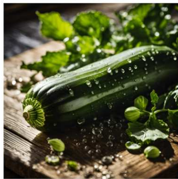
COURGETTE CUKINIA COURGETTE DOVLECEL