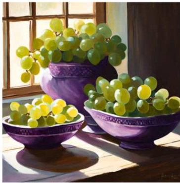
GRAPES WINOGRONA UVAS STRUGURI