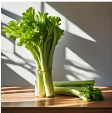
CELERY SELER AIPO ȚELINĂ