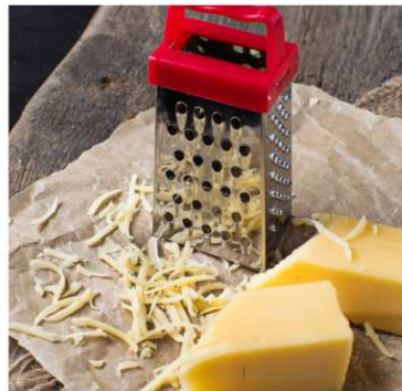
GRATER TARKA RALADOR RĂZĂTOARE