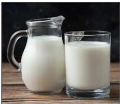
MILK MLEKO LEITE LAPTE