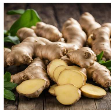
GINGER IMBIR GENGIBRE GHIMBIR