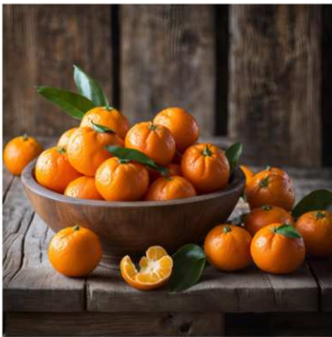
MANDARINES MANDARYNKI TANGERINAS MANDARINE