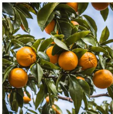
ORANGES POMARAŃCZE LARANJA PORTOCALĂ