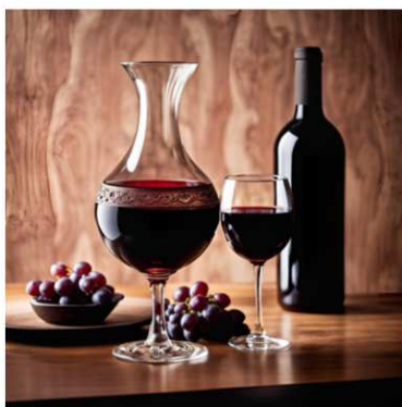
WINE WINO VINHO VIN