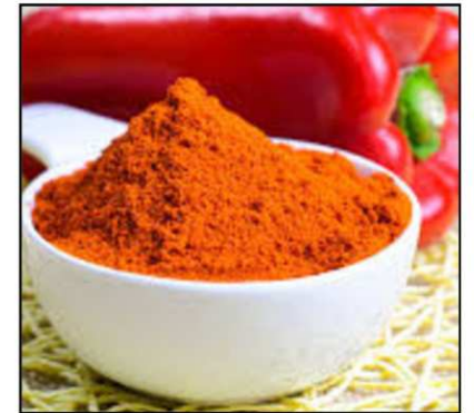
PAPRIKA PAPRYKA PAPRICA PAPRIKA