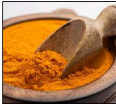
TURMERIC KURKUMA CÚRCUMA CURCUMA