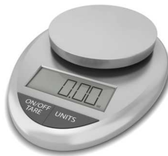
SCALE WAGA BALANÇAS BALANȚĂ