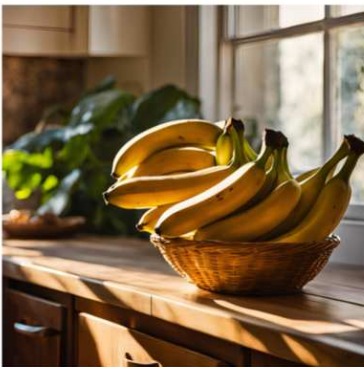
BANANAS BANANY BANANAS BANANE