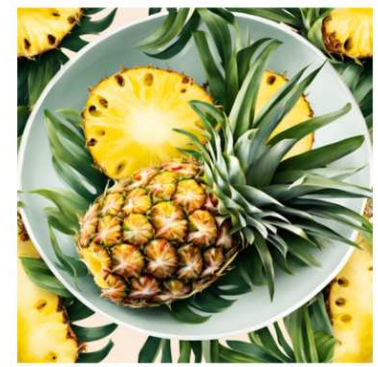
PINEAPPLE ANANAS ANANÁS ANANAS