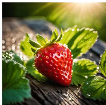
STRAWBERRY TRUSKAWKA MORANGO CĂPȘUNĂ