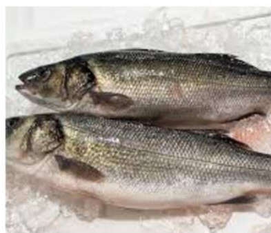
SEA BASS BAŃ MORSKI ROBALO BIBAN DE MARE