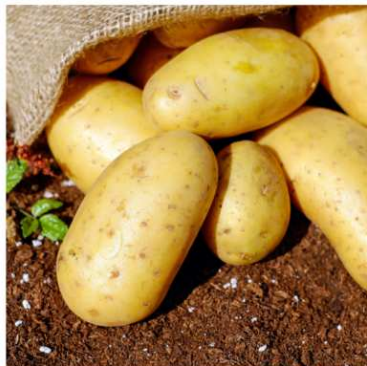
POTATO ZIEMNIAK BATATA CARTOF