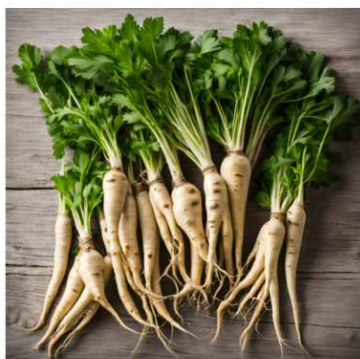
PARSLEY ROOT PIETRUSZKA RAIZ DE SALSA RĂDĂCINĂ DE PĂTRUNJEL