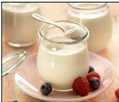
YOGHURT JOGURT IOGURTE IAURT