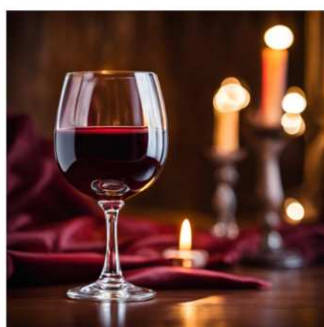
RED WINE GLASS KIELISZEK DO WINA COPO DE VINHO TINTO PAHAR DE VIN ROȘU