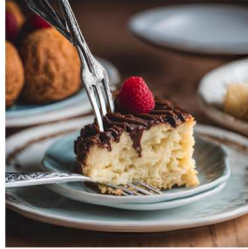
CAKE'S FORK WIDELEC DO CIAST GARFO DO BOLO FURCULIȚĂ TORTULUI