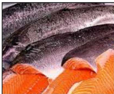
SALMON ŁOSOŚ SALMÃO SOMON