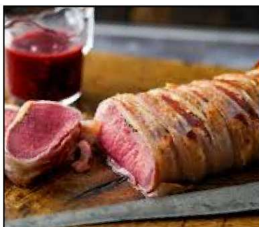
DEER JELEŃ VEADO CERB