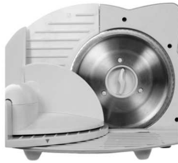
SLICER KRAJALNICA FIAMBREIRA FELIATOR