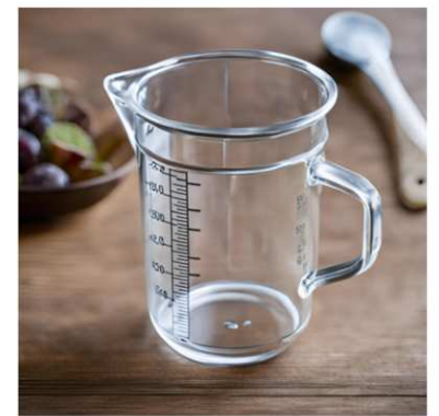
MEASURING CUP MIARKA COPO MEDIDOR CANĂ GRADATĂ