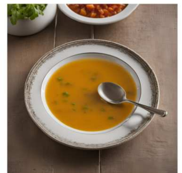
SPOON ŁYŻKA COLHER LINGURĂ