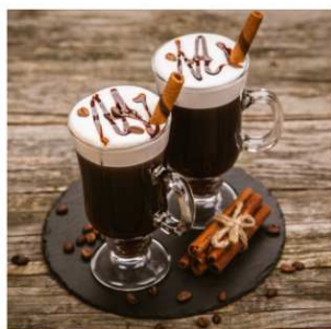
COFFEE GLASS SZKŁANKA DO KAWY COPO DE CAFÉ PAHAR DE CAFEA