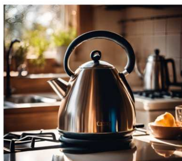
KETTLE CZAJNIK CHALEIRA CEAINIC