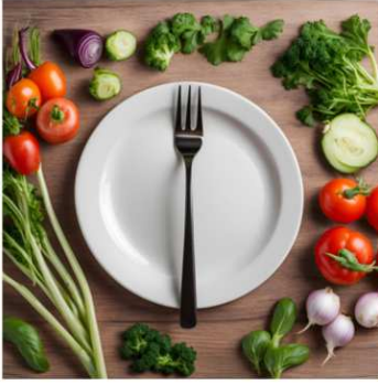
FORK WIDELEC GARFO FURCULIȚĂ