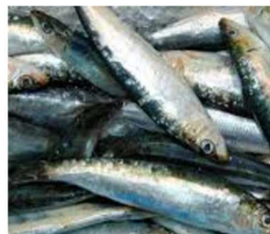
SARDINE SARDYNKA SARDINHA SARDINĂ