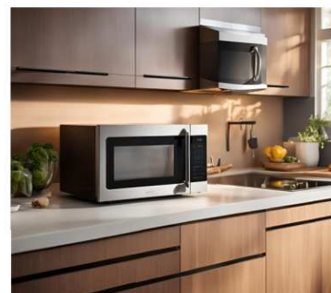
MICROWAVE MIKROFALÓWKA MICRO-ONDAS MICROUNDÉ