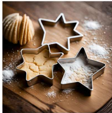
COOKIE CUTTER FOREMKI CORTADOR DE BISCOITOS ȚĂIETOR DE PRĂJITURI