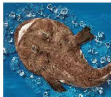
MONKFISH ŻABNICA TAMBORIL PEȘTE-CĂLUGĂR