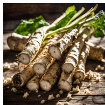
HORSE-RADISH CHRZAN RÁBANO HREAN-HREAN