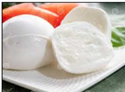
MOZZARELLA MOCARELLA MUSSARELA MOZZARELLA