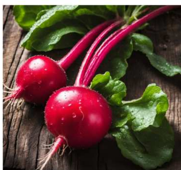
RADISH RZODKIEWKA RABANETE RIDICHE