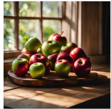
APPLES JABŁKA MERE MAÇÃS