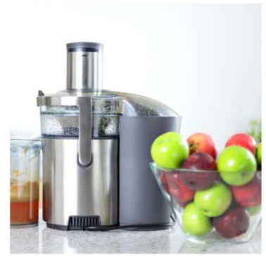
JUICE MAKER SOKOWIRÓWKA MÁQUINA DE ESPREMEDORES STORCĂTOR