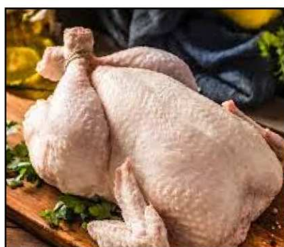
CHICKEN KURCZAK FRANGO PUI