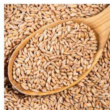
SPELT GROATS KASZA ORKISZOWA SÉMOLA DE ESPELTA CRUPE DE ALAC