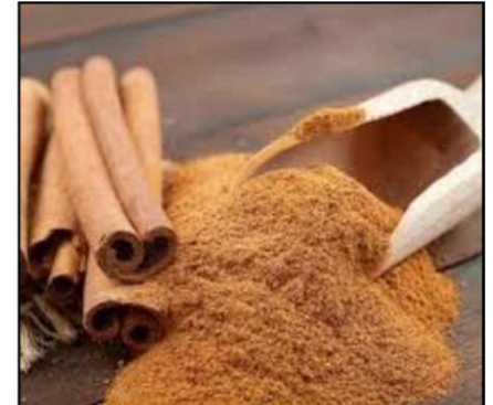
CINNAMON CYNAMON CANELA SCORȚIȘOARĂ