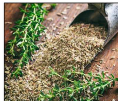
THYME TYMIANEK TOMILHO CIMBRU