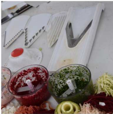
VEGETABLE CUTTER KRAJALNICA DO WARZYW CORTADOR DE LEGUMES FELIATOR DE LEGUME