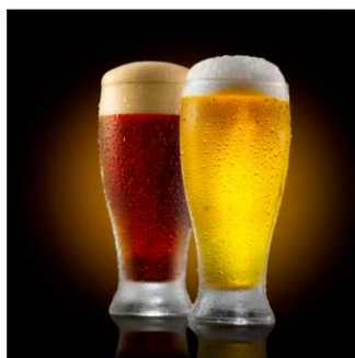
BEER GLASS SZKŁANKA DO PIWA COPO DE CERVEJA PAHAR DE BERE