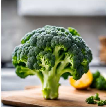
BROCCOLI BROKUŁY BRÓCOLOS BROCCOLI