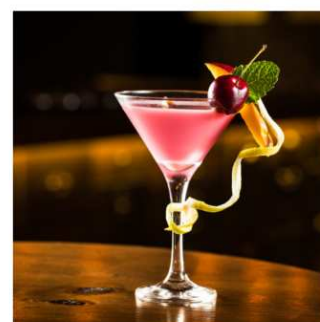
COCTAIL GLASS KIELISZEK DO KOKTAILU COPO DE COCKTAIL PAHAR DE COCKTAIL