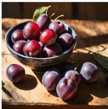
PLUMS ŚLIWKI AMEIXAS PRUNE