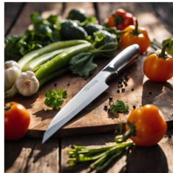
KNIFE NÓŻ FACA CUȚIT