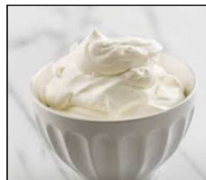
CREAM ŚMIETANA NATAS SMĂNTĂ