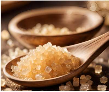
BROWN SUGAR BRAZOWY CUKIER AÇÚCAR MASCADO ZAHĀR BRUN