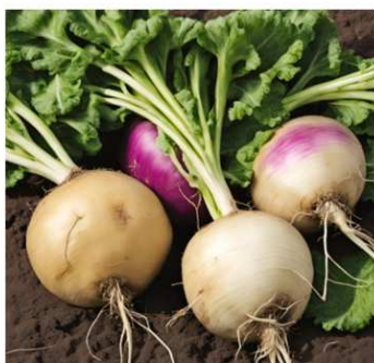
TURNIP RZEPA NABO NAP