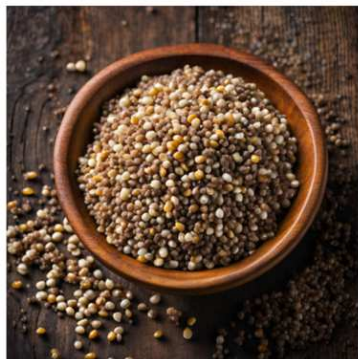
BUCKWHEAT GROATS KASZA GRYCZANA GRUMOS DE TRIGO MOURISCO CRUPE DE HRIȘCĂ