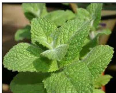
MINT MIĘTA HORTELĂ MENTĂ