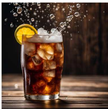
COLA KOLA COLA COLA