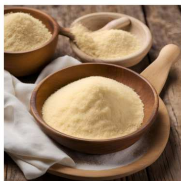
SEMOLINA (FROM WHEAT) KASZA MANA Z PSZENICY SEMOLINA (DE TRIGO) GRIȘ (DIN GRÂU)