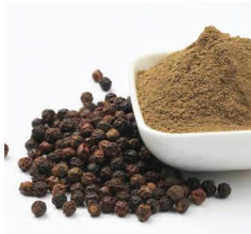
BLACK PEPPER CZARNY PIEPRZ PIMENTA PRETA PIPER NEGRU