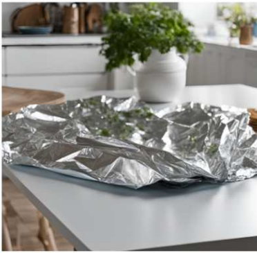
TINFOIL FOLIA ALUMINIOWA FOLHA DE ALUMINIO STANIOL