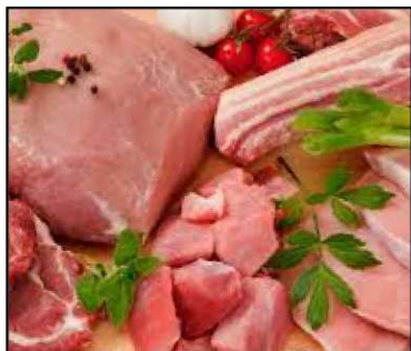
PORK WIEPRZOWINA PORCO PORC