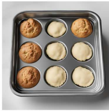
BAKING TIN FORMA DO PIECZENIA FORMA PARA BOLOS TAVĂ DE COPT