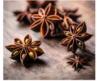
ANISE ANYŻ ANIS ANASON