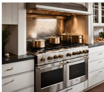
OVEN PIEKARNIK FORNO CUPTOR