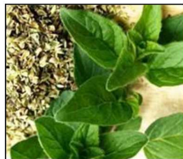
OREGANO OREGANO ÓREGÃOS OREGANO