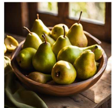
PEARS GRUSZKI PERAS PERE