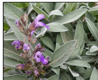
SALVIA SZAŁWIA SALVIA SALVIE