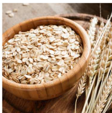
OAT GROATS KASZA OWSIANA GRUMOS DE AVEIA CRUPE DE OVĂZ