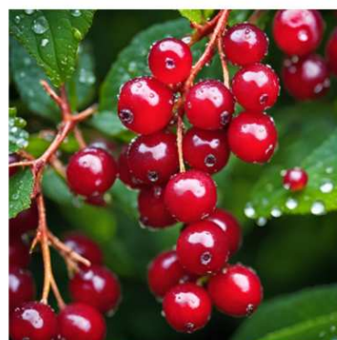
CRANBERRY ŽUWARINA ARANDO MERIȘOR