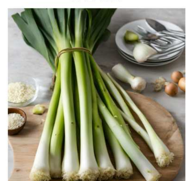
LEEK POR ALHO-FRANCES PRAZ