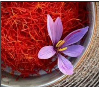
SAFFRON SZAFRAN AÇAFRÃO ȘOFRAN