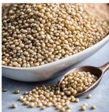
PEARL BARLEY KASZA JĘCZMIENNA PERŁOWA CEVADA PÉROLA ORZ PERLAT