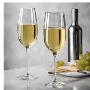
WHITE WINE GLASS KIELISZEK DO BIAŁEGO WINA COPO DE VINHO BRANCO PAHAR DE VIN ALB