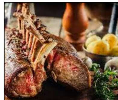
LAMB JAGNIĘCINA BORREGO MIEL