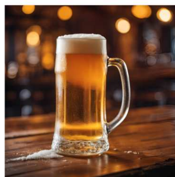
BEER PIWO CERVEJA BERE