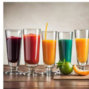
JUICE SOK SUMO SUC