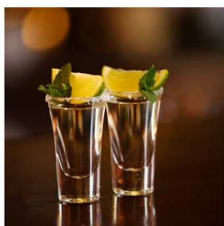
SHOT GLASS KIELISZEK COPO DE SHOT STICLĂ DE SHOT