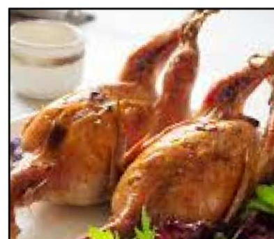
QUAIL PRZEPIÓRKA CODORNIZ PREPELIȚĂ