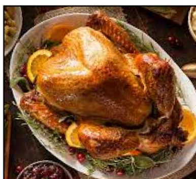
TURKEY INDYK PERÚ CURCAN