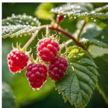
RASPBERRY MALINAI FRAMBOESA ZMEURĂ