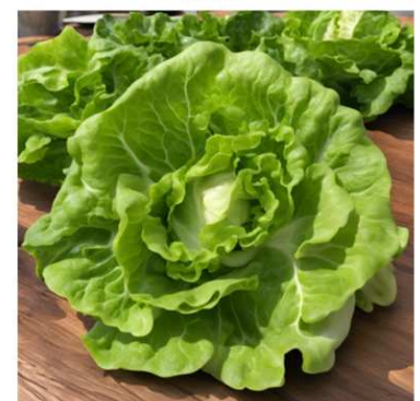
LETTUCE SAŁATA ALFACE SALATĂ