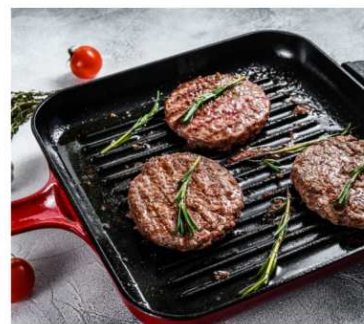
GRILL PAN PATELNA GRILOWA GRELHADOR TIGAIÉ PENTRU GRĂȚAR