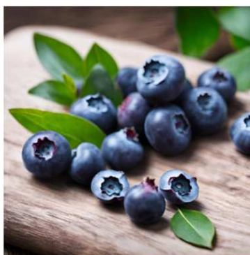
BLUEBERRY BORÓWKA MIRTILO AFINĂ