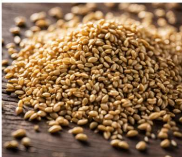
SESAME SEZAM SÉSAMO SUSAN