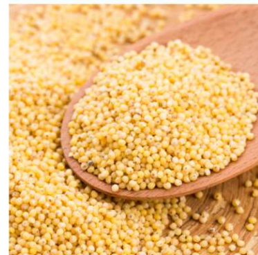
MILLET GROATS KASZA JAGLANA SEMENTE DE MILHO CRUPE DE MEI