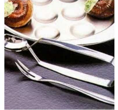
SNAIL'S FORK WIDELEC DO ŚLIMAKÓW GARFO DE CARACOL FURCA LUI SNALE