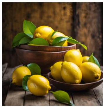
LEMON CYTRYNA LIMÃO LĂMĂIE