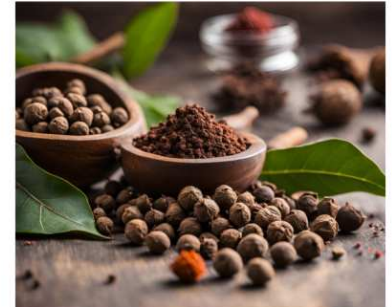
ALLSPICE ZIELE ANGIELSKIE PIMENTA IENIBAHAR