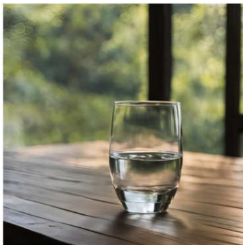
STILL WATER WODA NIEGAZOWANA ÁGUA SEM GÁS APĂ PLATĂ