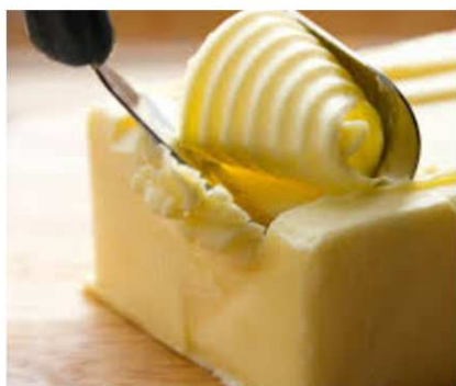
BUTTER MASŁO MANTEIGA UNT