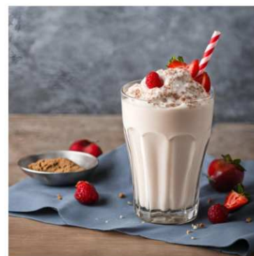
MILKSHAKE KOKTAIL MLECZNY BATIDO MILKSHAKE