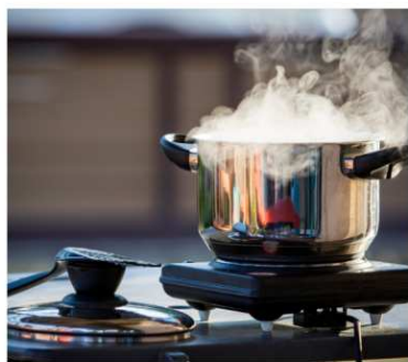
SAUCEPAN GARNEK PANELA CRATIȚĂ