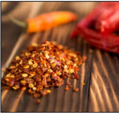
PEPPER PIEPRZ PIMENTA PIPER