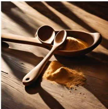
WOODEN SPOON ŁYŻKA DREWNIANA COLHER DE PAU LINGURĂ DE LEMN