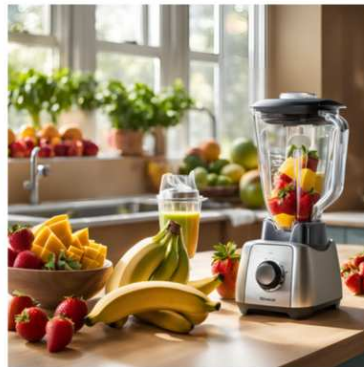
BLENDER LIQUIDIFICADOR BLENDER BLENDER