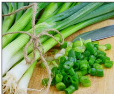
CHIVES SZCZYPIOREK CEBOLINHO ARPAGIC