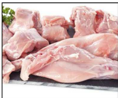
RABBIT KRÓLIK COELHO IEPURE