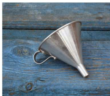
FUNNEL LEJEK FUNIL PÂLNIE