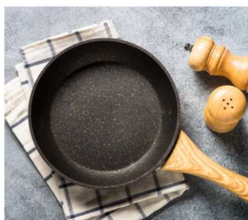
FRYING PAN PATELNA FRIGIDEIRA TIGAIÉ