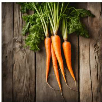
CARROT MARCHEWKA CENOURA MORCOV