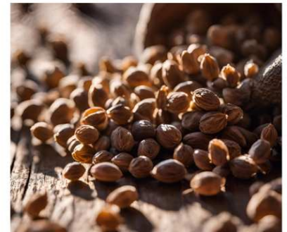
JUNIPER JAŁOWIEC ZIMBRO IENUPĂR