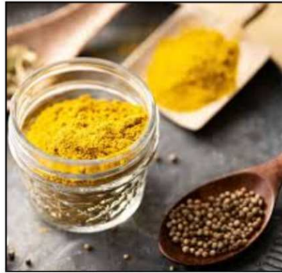
CURRY CURRY CARIL CURRY