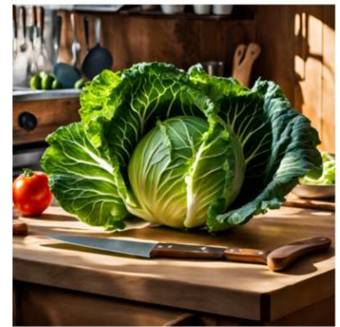
CABBAGE KAPUSTA COUVE SALATĂ