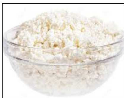
RENNET PODPUSZCZKA COALHO COAGUL